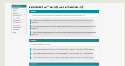
Final Exam – Certificates Provided.