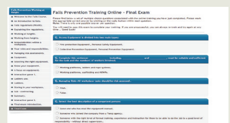
Final Exam – Certificates Provided.

All businesses employing staff who work at height are required to provide training to reduce the risk of falls.